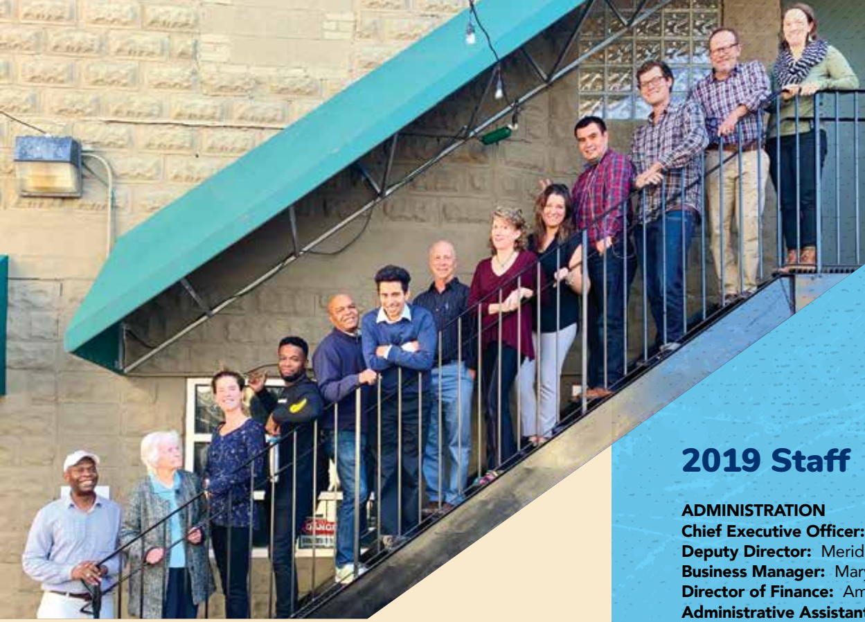
2019 Staff on the back stairs of the SCC office in Union Square